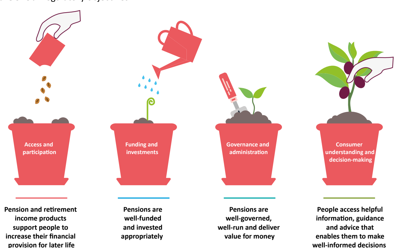
Figure 3: Our regulatory objectives

Note: By 'pensions', we mean all types of pension, including products such as annuities and drawdown, that are used to generate an income in retirement. 'People' refers to members of occupational schemes, as well as consumers of private pensions.